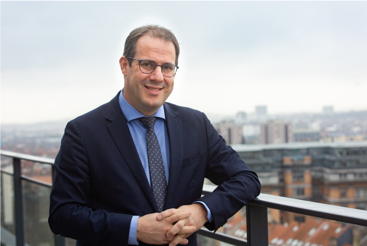
Federal Minister for Agriculture, David Clarinval